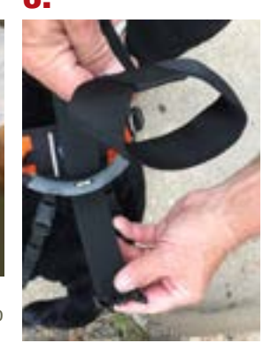
Pass the clip under the back handle.