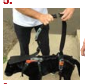
Bring it up to reconnect with the Front half of the leash or handle. Pulling on it will lock it in place. You're on your way!